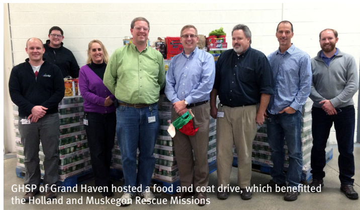
GHSP of Grand Haven hosted a food and coat drive, which benefitted the Holland and Muskegon Rescue Missions