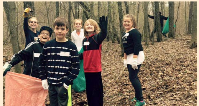
Sixth graders from White Pines Middle School volunteering during Jr. DOC

Support for the Junior Day of Caring student transportation was provided by a grant from the Friends of Ottawa County Parks.