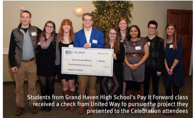
Students from Grand Haven High School's Pay it Forward class received a check from United Way to pursue the project they presented to the Celebration attendees