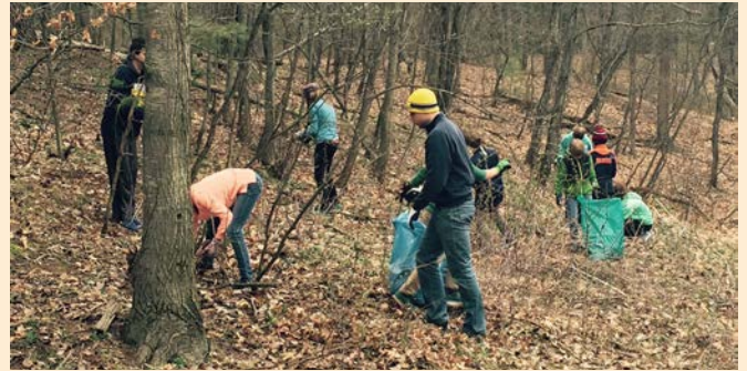
White Pines Middle School students helped remove invasive species and picked up trash at Hemlock Crossings during Junior Day of Caring

From April 18-22, nearly 500 sixth graders from White Pines Middle School volunteered at county parks as part of Greater Ottawa County United Way's fifth annual Junior Days of Caring , the largest volunteer event in Ottawa County.