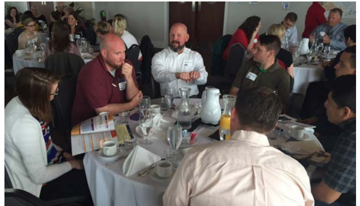
Participants engaging in a roundtable discussion about the lack of affordable housing in Ottawa County during the Community Conversation on April 19