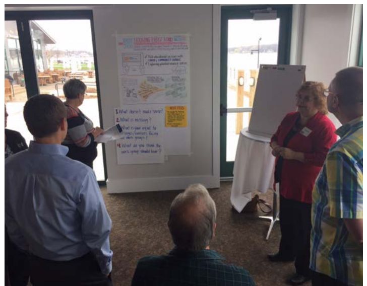
Attendees gathered to brainstorm about a variety of solutions to increase affordable housing - this group discussed the idea of having a Housing Trust Fund