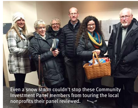
Even a snow storm couldn't stop these Community Investment Panel members from touring the local nonprofits their panel reviewed.

This year, 44 nonprofit organizations that run 59 programs in Ottawa County applied for funding from Greater Ottawa County United Way during year one of the two-year Community Investment (CI) process . The CI process brings together community volunteers from across the county to review and evaluate these programs for their effectiveness and efficiency. The programs are divided among 11 panels within United Way's four impact areas of Education, Financial Stability, Health and Basic Needs .