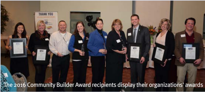
The 2016 Community Builder Award recipients display their organizations' awards