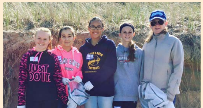
Lakeshore Middle School eighth graders picked up trash on the beach at Rosy Mound for their Junior Day of Caring on Friday, May 6