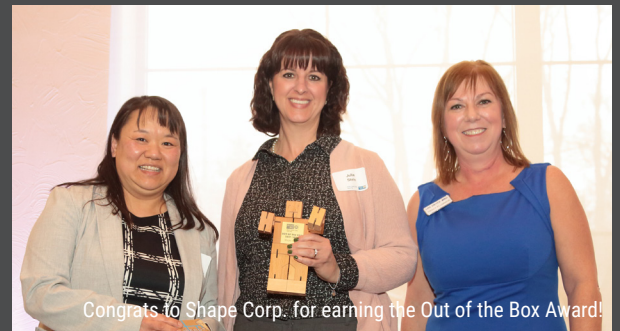
Congrats to Shape Corp. for earning the Out of the Box Award!