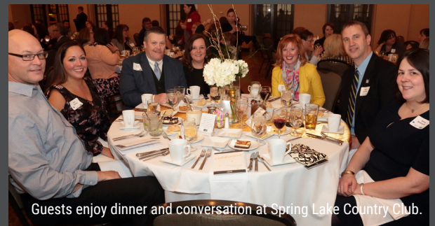
Guests enjoy dinner and conversation at Spring Lake Country Club.