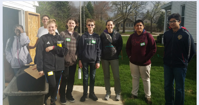
Eighth graders from Lakeshore Middle School helped out at The People Center in Spring Lake.