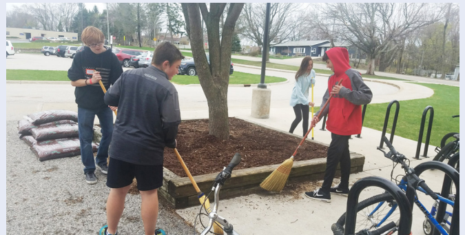
Students were outdoors for spring cleaning at Lakeshore Middle School during Junior Day of Caring.

Support for the Junior Day of Caring student transportation was provided by grants from the Friends of Ottawa County Parks and 2018 Global Youth Service Day Grant from the Michigan Community Service Commission.