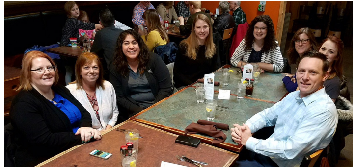
Above: United Way staff at New Holland Brewing Company during Housing Matters. Below: Brunch at The Biscuit while supporting Housing Matters.

Thank you to our sponsors, including presenting sponsor, Lake Michigan Credit Union ; roof sponsors Gentex, HUB International , the City of Holland and Best Financial Credit Union/County Teachers Insurance Agency ; and brick sponsor Hooker DeJong, Inc.