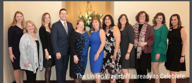
The United Way Staff is ready to Celebrate.