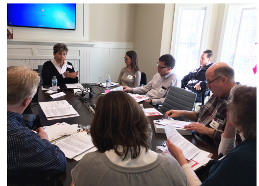
Panel members listen during a presentation at The Little Red House during the community investment process.