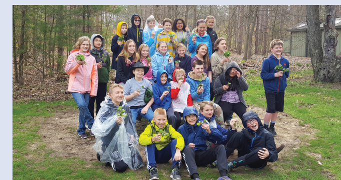
White Pines middle schoolers volunteered at local parks during Jr. Day of Caring