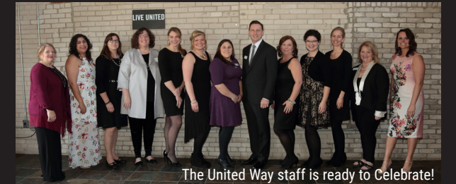
The United Way staff is ready to Celebrate!