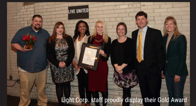
Light Corp. staff proudly display their Gold Award