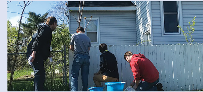
Lakeshore Middle School students helped with painting projects at The Salvation Army in Grand Haven during Jr. Day of Caring

From April 18-28, more than 450 sixth graders from White Pines Middle School volunteered at county parks as part of Greater Ottawa County United Way's sixth annual Junior Days of Caring, the largest volunteer event in Ottawa County.