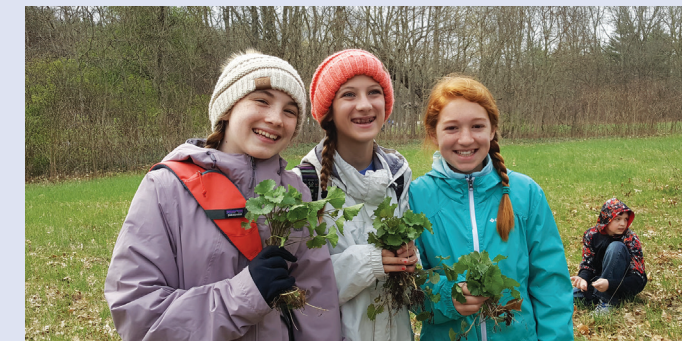
Sixth graders from White Pines Middle School show off the invasive species they removed from a local park.

Support for the Junior Day of Caring student transportation was provided by grants from the Friends of Ottawa County Parks and 2017 Global Youth Service Day Grant from the Michigan Community Service Commission.