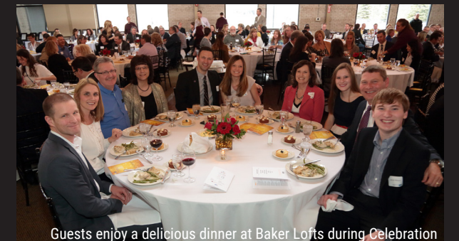
Guests enjoy a delicious dinner at Baker Lofts during Celebration