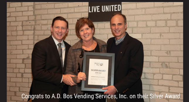
Congrats to A.D. Bos Vending Services, Inc. on their Silver Award

Thank you to DeVries Photography for our Celebration photos. Prints are available for purchase at www.DeVriesphoto.com . View all of our Celebration photos on our Facebook page.