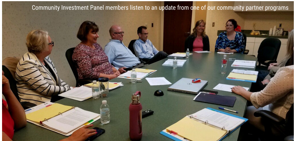
Community Investment Panel members listen to an update from one of our community partner programs