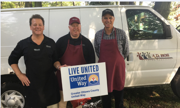
Thanks to A.D. Bos Vending Services for providing our volunteers with a delicious lunch despite the rainy weather!