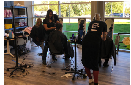
L: West Michigan Works was ready to greet and help potential job applicants. R: Stylists from Phoenix Salon and Day Spa provided 43 free haircuts to those in need!