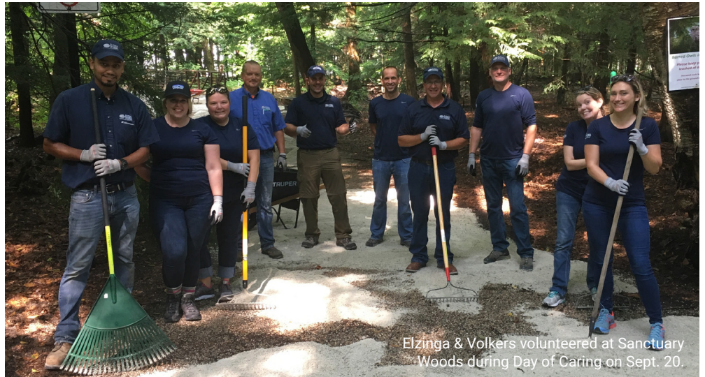
Elzinga & Volkers volunteered at Sanctuary Woods during Day of Caring on Sept. 20.