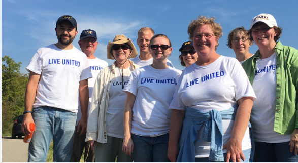
DeLong and Brower, PC cleared invasive species during Day of Caring.