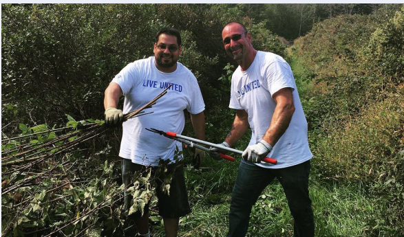
Haworth employees worked hard to spruce up Huyser Farm.