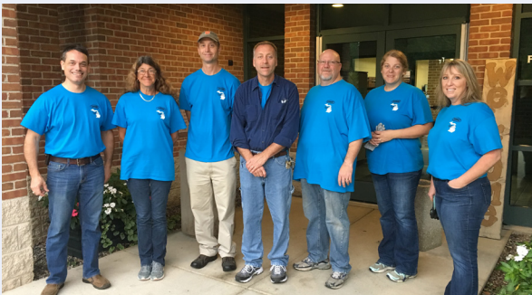
Employees from Tennant Company helped with projects at Holland Rescue Mission.