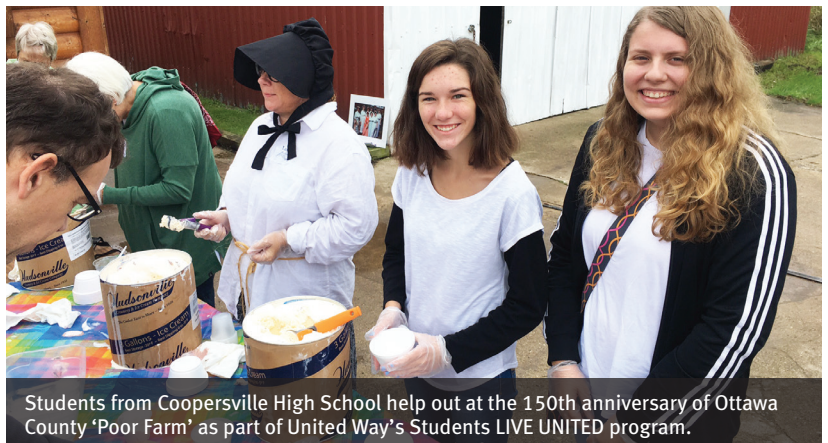
Students from Coopersville High School help out at the 150th anniversary of Ottawa County 'Poor Farm' as part of United Way's Students LIVE UNITED program.