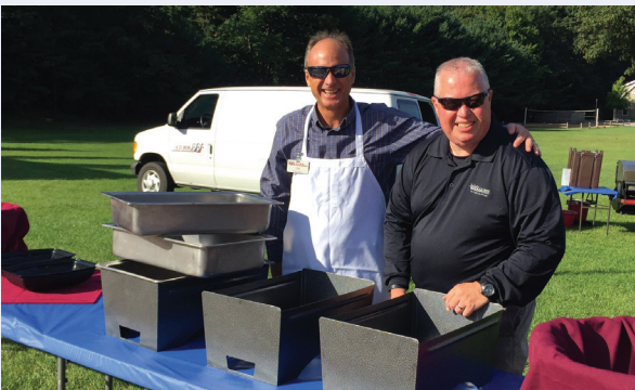
Thank you to A.D. Bos Vending Services for providing the food (along with Tyson Foods) and serving our volunteers.