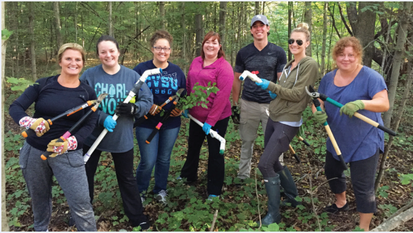
Smile Grand Haven helped remove invasive species at Pigeon Creek Park.