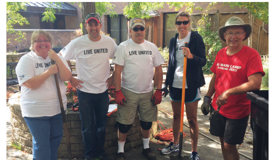
Left: GHSP employees helped clear brush and winterize the community garden at Love, Inc. Tri-Cities.