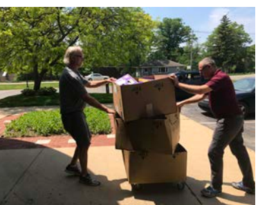
Above: A group from Haworth volunteered during Day of Caring in Sept. 2018. Below: Volunteers collected items for May Baskets.