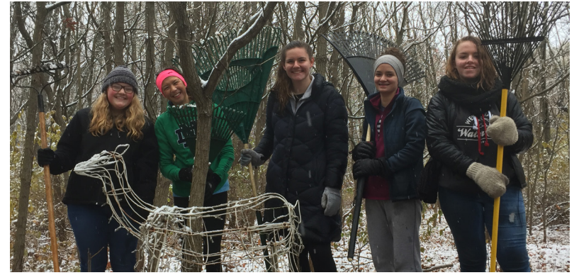
Students Live United volunteers from Allendale, Spring Lake (left) and West Ottawa (right) helped local residents during Rake A Difference in Nov. 2018.