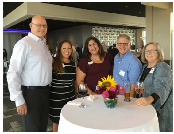
Leadership donors enjoyed the Lighthouse Leadership Circle appreciation event in Sept. 2018. See pages 12-13 for the full list of leadership donors.