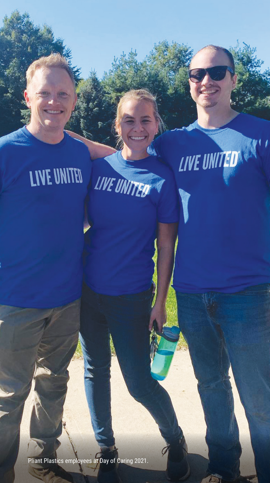
Pliant Plastics employees at Day of Caring 2021.