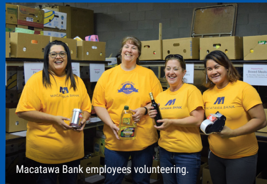
Macatawa Bank employees volunteering.