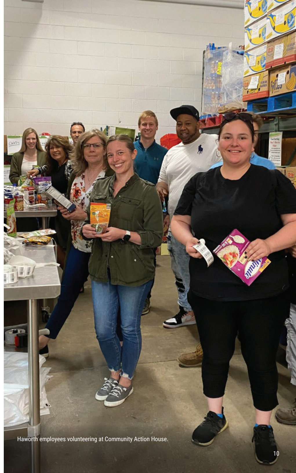
Haworth employees volunteering at Community Action House.

"We get so much information from the agency applications, but the one thing that has always made an impact for me is hearing the testimonials from someone that has benefitted from the investment process. Having someone in front of you that has had their life changed for the better because of United Way funding is something that is hard to match when it comes to the allocation process. I find it so rewarding to be able to work with other members of the community."