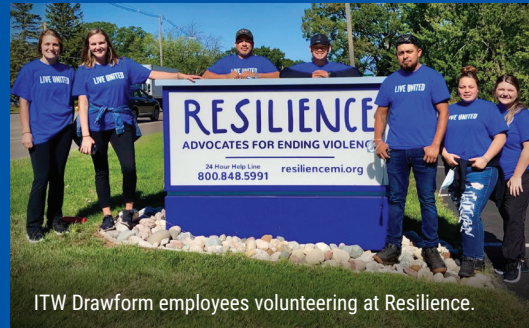
ITW Drawform employees volunteering at Resilience.

"As the coordinator for the Volunteer Emergency Response Team, I send volunteers out into the community close to six times a month to deliver food and health supplies to seniors, families, and the homeless in need. I've always been so impressed with this group; they give so selflessly and do it at the drop of a dime. One busy Thursday, I was working and received an email from the Salvation Army that a man living in a tent behind Target was in dire need of food and water. I sent the usual ask to the team for help, but this was the only time in 2 years that no one was available. I decided to take the food myself – after all, volunteering is for everyone, and I wanted to practice what I preached. When I pulled up to the area, I saw a man in dirty clothes with dirty skin and a good-sized beard. I didn't know what to say, so I went into mom mode. I gave him a big smile and said, 'Hello, my friend.' I asked him if he would like to help me unload supplies into his wagon. When we finished, I hugged him and said, 'We all have tough times.' He smiled and said with tears in his eyes, 'We do. Thank you so much. I really needed this.' I will never forget that moment and how it made me feel. Of all the things I do in a day, this will always be one of the most fulfilling. Since this moment, I've brought my friend many more food boxes. I understand the power of giving much better now that I've experienced it first-hand."