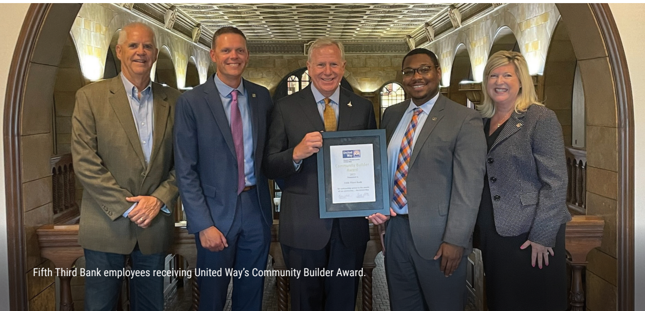
Fifth Third Bank employees receiving United Way's Community Builder Award.