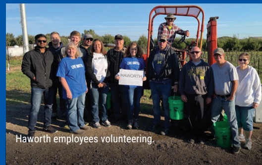
Haworth employees volunteering.