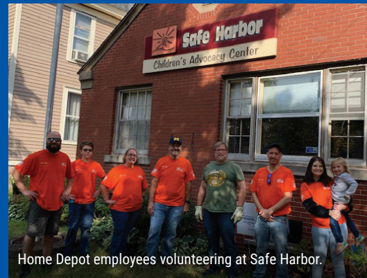
Home Depot employees volunteering at Safe Harbor.