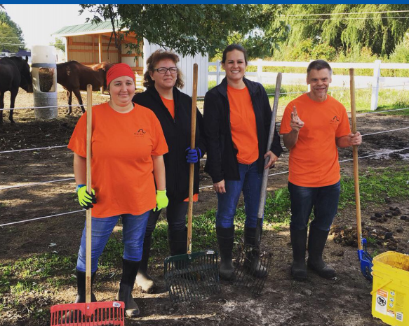
The Arc of Allegan County volunteered at Renew Therapeutic Riding Center during Day of Caring.