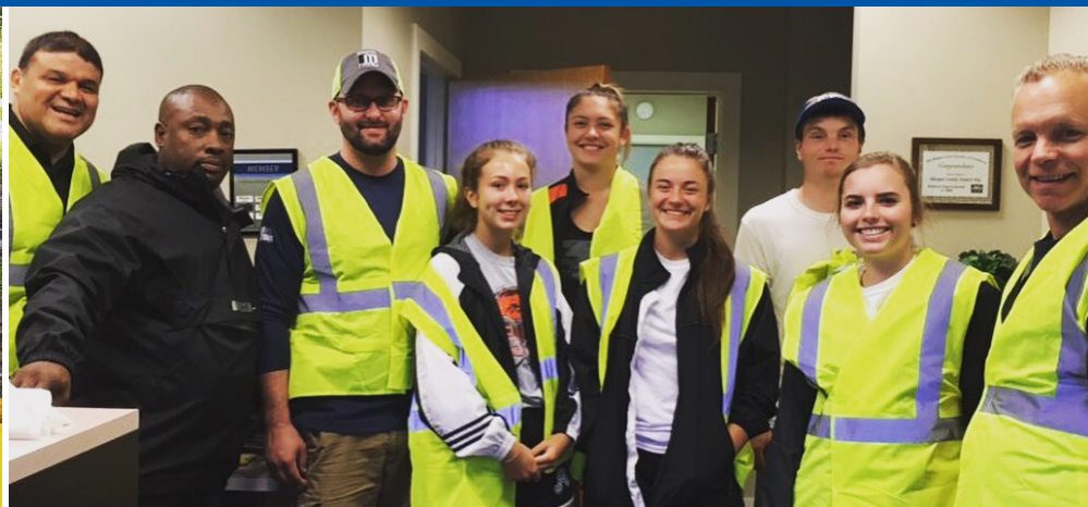
Volunteers gathered at our office before the Adopt-A-Highway clean-up in July 2018.