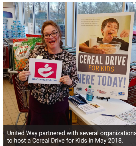
United Way partnered with several organizations to host a Cereal Drive for Kids in May 2018.