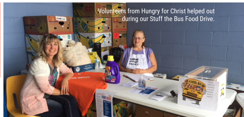
Volunteers from Hungry for Christ helped out during our Stuff the Bus Food Drive.