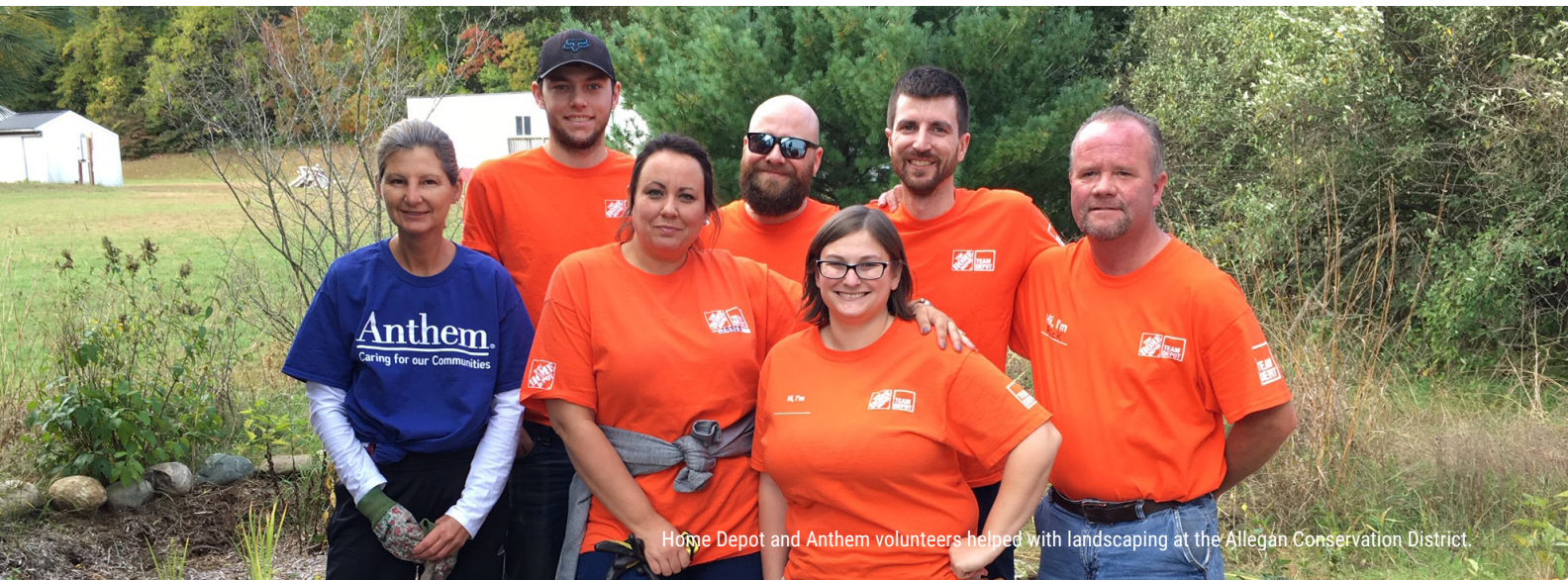
Home Depot and Anthem volunteers helped with landscaping at the Allegan Conservation District.